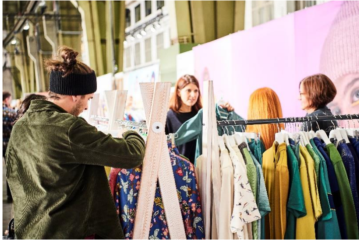
Neonyt Lab, 24 to 26 June 2022, Union Halle, Frankfurt am Main